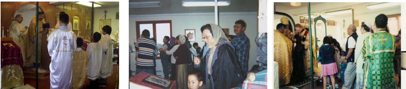
Worshiping in the rented Moravian Building since February 2000.