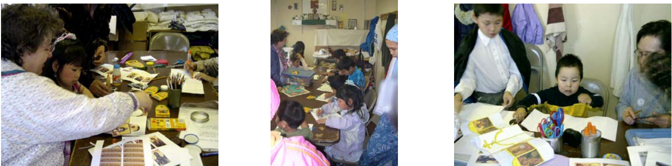
First Sunday School Program developed on the second floor of the Moravian building in 2006. “Sister Parish” project of Outreach Alaska – Building on a sure foundation!